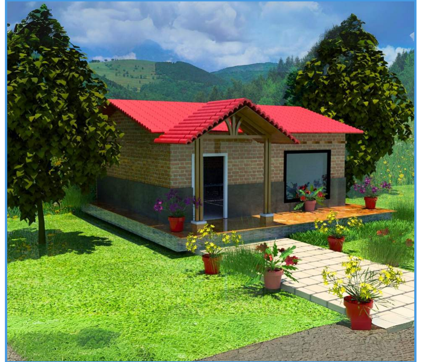
INTERIOR & EXTERIOR