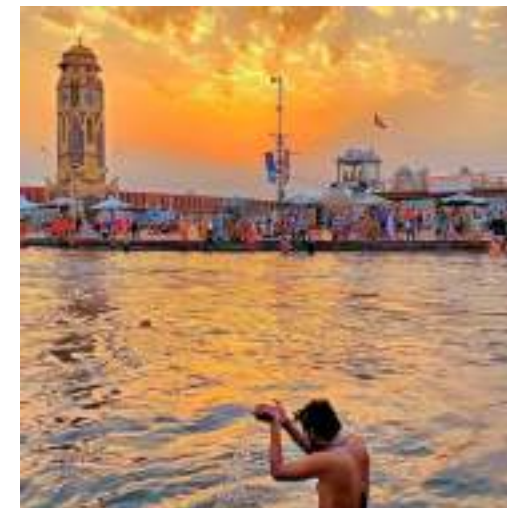
Ganga Ji River