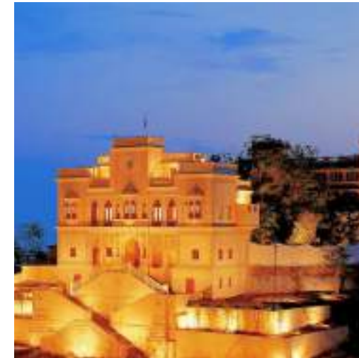
Ananda Resort & Spa