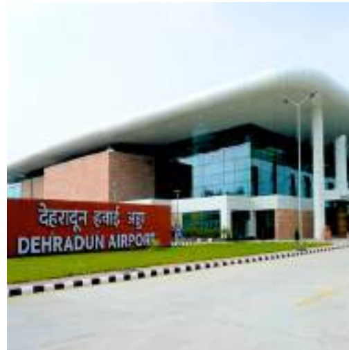
Jolly Grant Airport