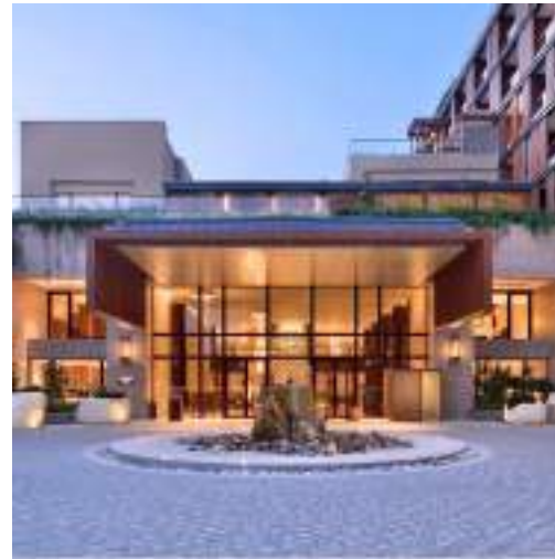
The Westin Resort & Spa