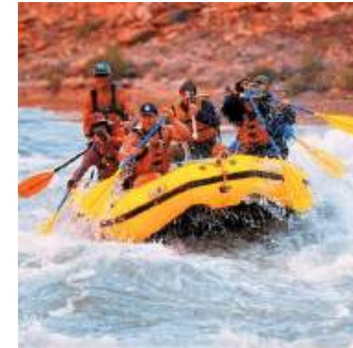
Rafting Point Shivpuri